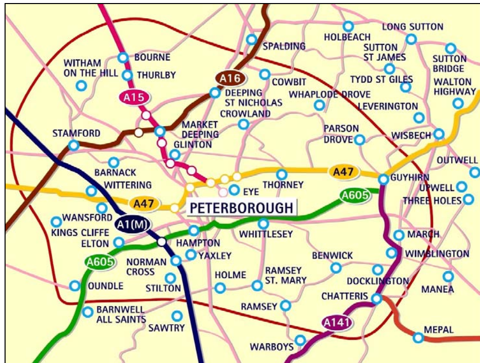
Figure 4 – Nominal Catchment Area